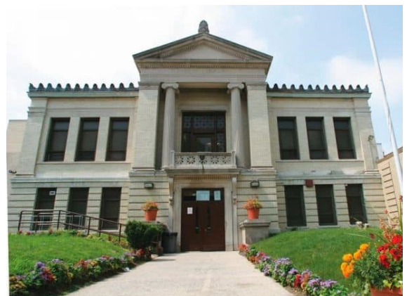
Mount Vernon Public Library 2021

Since receiving our charter, the library has experienced numerous changes and transformations. However, some things remain constant: the Mount Vernon Public Library's commitment to promoting literacy for people of all ages, our determination to provide the community with the latest technological advances, and our desire to engage patrons through innovative collections, services and programming.